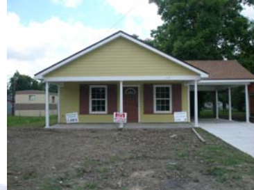
719 COURREGE STREET