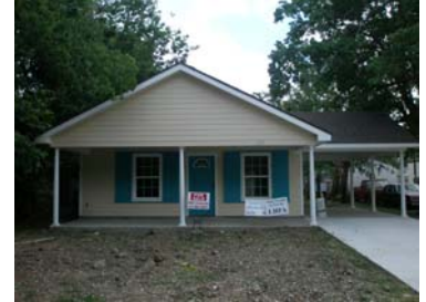
709 COURREGE STREET