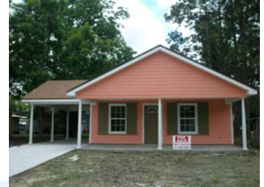
721 COURREGE STREET

MORTGAGE COULD RANGE FROM $63,315 to $107,098