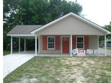
819 LOMBARD STREET